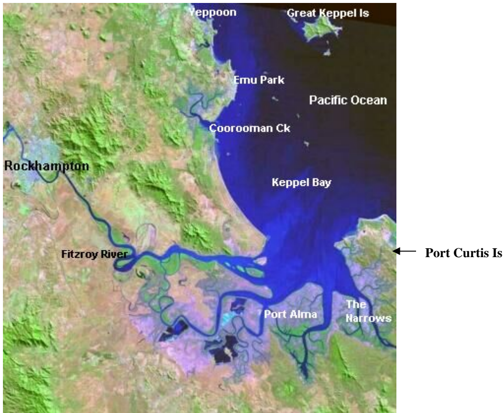
Figure 3. The Fitzroy River estuary

The estuary depth varies from 3 to 7 metres at mid tide and tides range from 0.3 to 4 metres. Large tides create high velocity tidal flows and the estuary is classified as tide – dominated. This means the estuary has moderate sediment trapping efficiency, naturally high turbidity, well mixed circulation and there is some risk of habitat modification due to sedimentation (NLWA 2002).